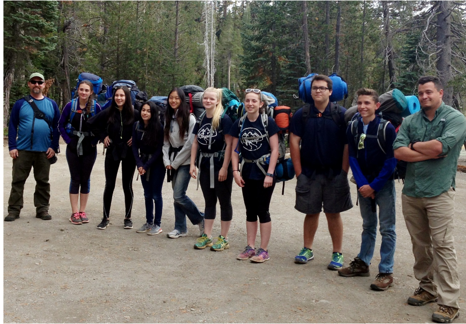
UJA students and staff pose for a group picture before taking off on their backpacking trip last month.

UJA has a new Skate City fund raiser. The office and the classrooms have an unlimited supply of coupons to take to Skate City any Sunday afternoon 1:00-3:30 pm or 2:30-5:00 pm, or any Wednesday evening from 6:00-8:00 pm, or any Saturday night from 7:30-10:00 pm through December 30, 2016. Each time you go to skate, you will need to take a coupon. Admission is $7.00 and includes free skate rental. UJA will receive $1.00 for every coupon redeemed. Get coupons for all your friends and family members! This fund raiser is taking the place of assigning UJA skating dates during the school year. Skate City is located at 2146 S. State Street.